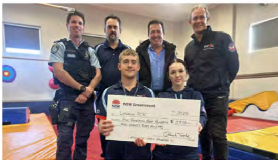
Lithgow PCYC staff with Member for Bathurst Paul Toole.

By Reidun Berntsen Updated June 28 2024 - 4:27pm, first published 3:00pm