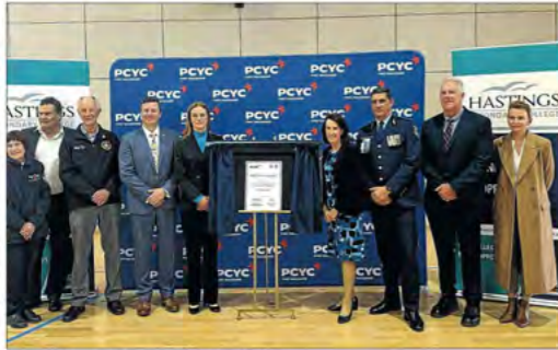
Representatives unveiling the plaque for the new PCYC.